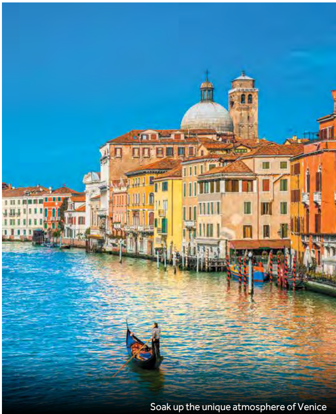
Soak up the unique atmosphere of Venice