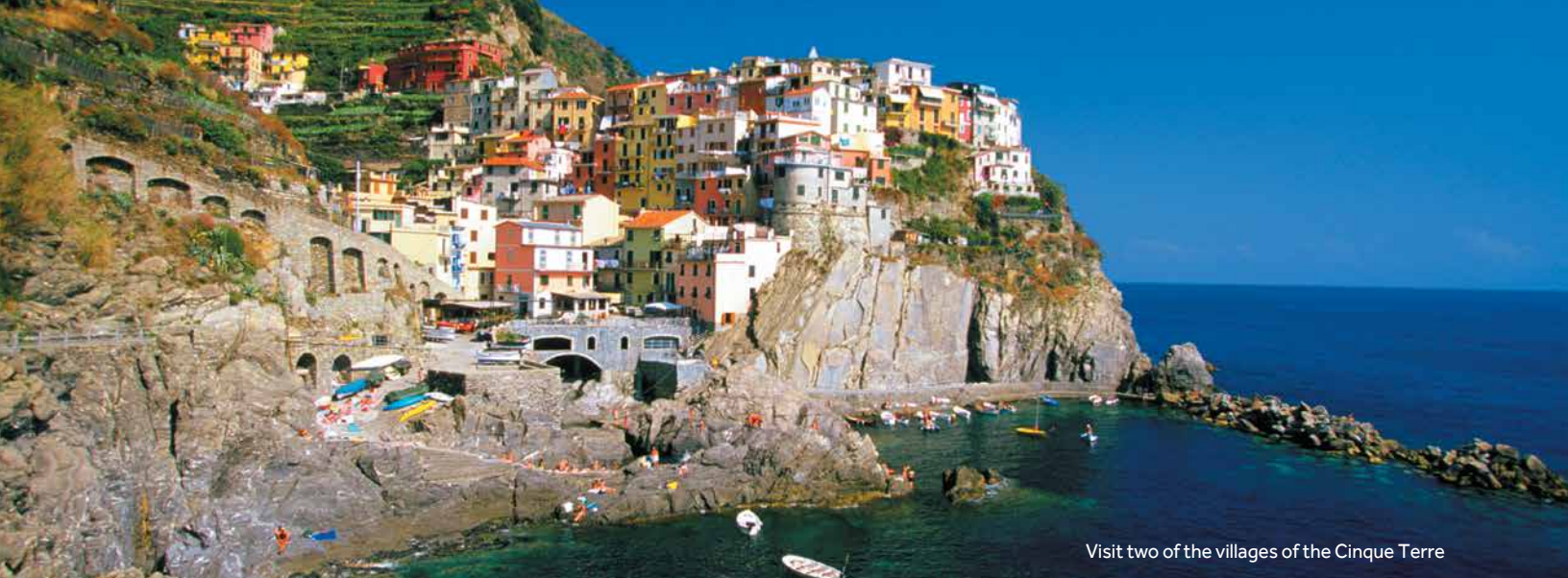
Visit two of the villages of the Cinque Terre