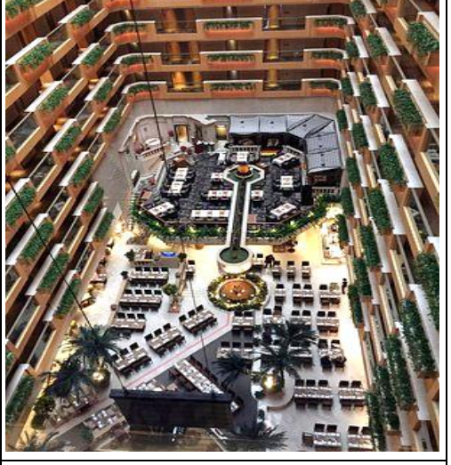
Silka Tsuen Wan Hotel (4★) 119 Wo Yi Hop Rd, Kwai Chung, Hong Kong