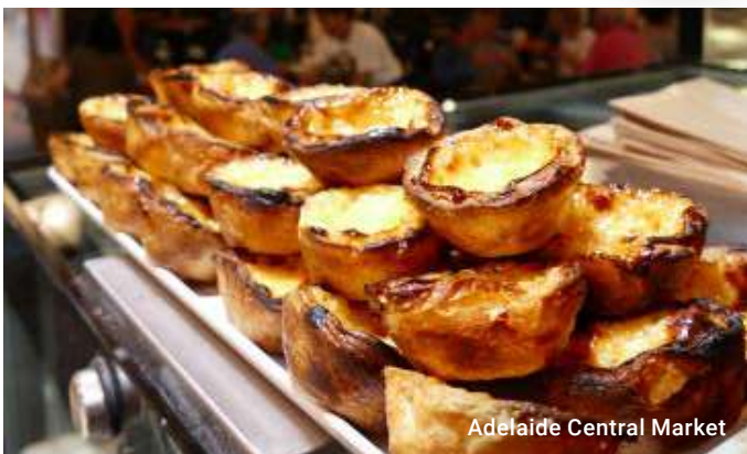
Adelaide Central Market