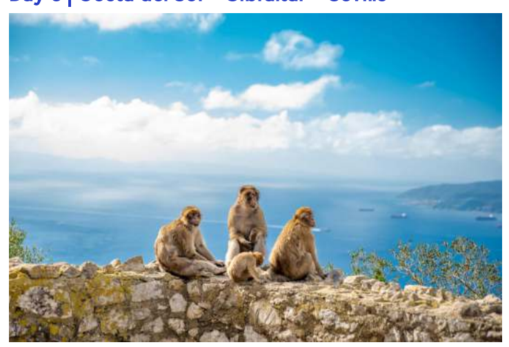
Day 6 | Costa del Sol - Gibraltar - Seville

Explore a slice of Britain when you cross the border into Gibraltar, the much-contested gateway to the Mediterranean Sea. Maybe join a Choice Experience to get up close to the Barbary apes and visit the cave of St. Michael at the Rock of Gibraltar, the Roman and Greeks' former pillar of the "known world". Next, we return to Spain, travelling north through the Andalusian countryside to sizzling Seville.