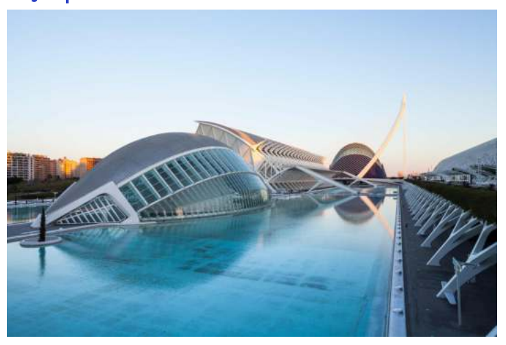
Day 3 | Barcelona - Peñíscola - Valencia

Today we'll skirt along the Costa Dorada, a gleaming strip of the Mediterranean coastline, travelling past expansive orange groves to Peñíscola. You'll see its imposing 13<sup>th</sup>-century Templar Castle, famed as the dramatic backdrop for the Hollywood classic El Cid. Then continue to Valencia, catching a glimpse of the iconic highlights of this bustling modern metropolis on your orientation tour with your Travel Director. View the Art Nouveau, Train Station Estación del Norte, the Towers of Serrano and Quart. Next, leave the present behind and admire the futuristic 'City of Arts and Sciences', a cultural complex built into the Turia riverbed.