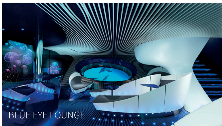
BLUE EYE LOUNGE