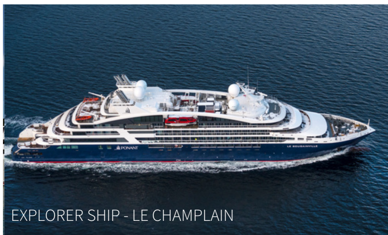
EXPLORER SHIP - LE CHAMPLAIN

Exclusive Partnership with Alain Ducasse on their culinary standard