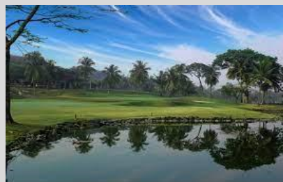
Lotus Lake Golf Club