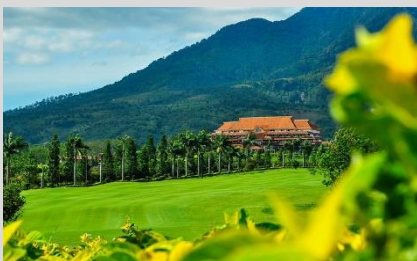
Jatinangor National Golf & Resort