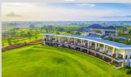
Parahyangan Golf Bandung