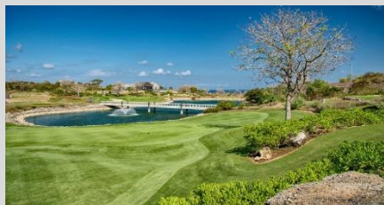
Bukit Pandawa Golf Club