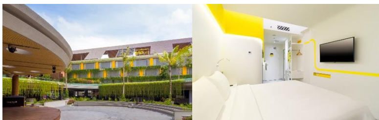
YELLO Kuta Beachwalk (Local 4★)

Jl. Pantai Kuta, Kabupaten Badung, Bali, Indonesia 80361