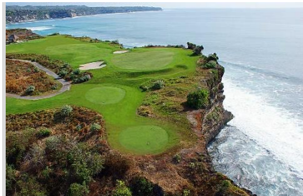
New Kuta Golf