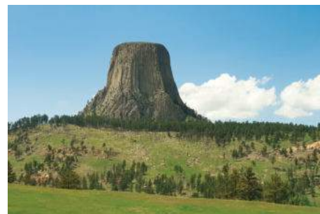
TOP RATED HIGHLIGHT Devil's Tower. (Day 6, Black Hills)