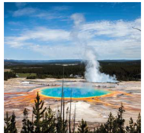
YELLOWSTONE NATIONAL PARK