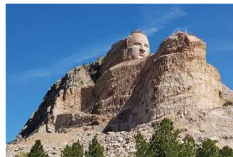
MAKE TRAVEL MATTER Crazy Horse Memorial. (Day 8, Black Hills)