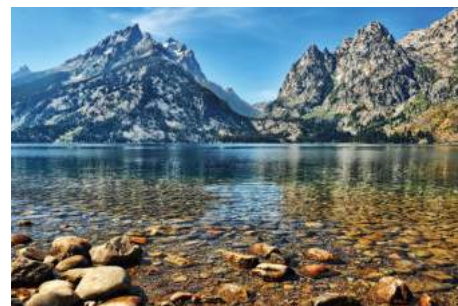
TOP RATED HIGHLIGHT See Jenny Lake. (Day 2, Grand Teton National Park)

It's time to say goodbye to your fellow travellers. Guests flying out of Rapid City will be taken to Rapid City Regional Airport. A transfer to Denver International Airport is available for guests flying out of Denver, where arrival is at approximately 16:30. (B)