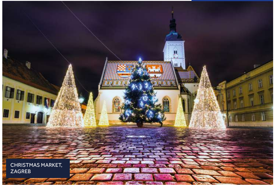
CHRISTMAS MARKET, ZAGREB

Transfers from Zagreb airport to your hotel depart at 11:30 and 14:00. Discover Croatia's two-tiered capital, as you drive through the squares of the Lower Town and board the city's funicular to the medieval Upper Town. Visit the world-famous Postojna Caves and admire the stunning rock formations. Marvel at the Baroque elegance of the Old Town in Ljubljana and meet Urban Modic, an esteemed artist. Stroll through the well-preserved and historic city centre in Graz, a UNESCO World Heritage listed site.