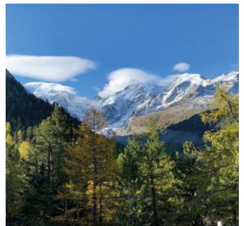
@ALLY6673, NEAR ST. MORITZ, SWITZERLAND