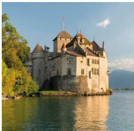
CHILLON CASTLE, LAKE GENEVA