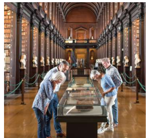
TRINITY COLLEGE, DUBLIN