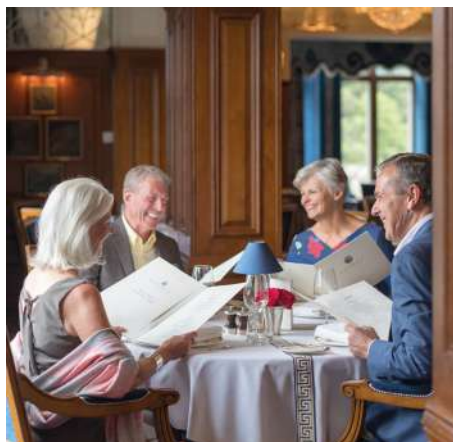
AUTHENTIC DINING, ASHFORD CASTLE