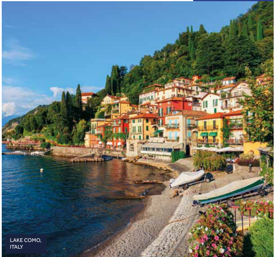
LAKE COMO, ITALY