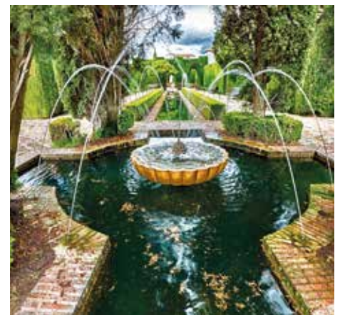
ALHAMBRA GENERALIFE GARDEN, GRANADA