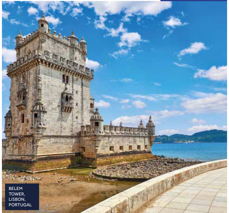
BELEM TOWER, LISBON, PORTUGAL