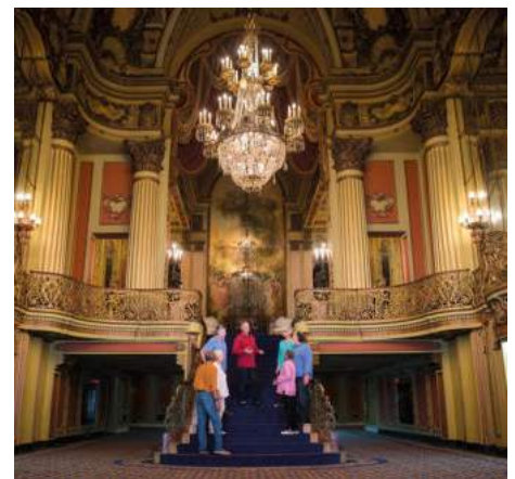
LOS ANGELES THEATRE