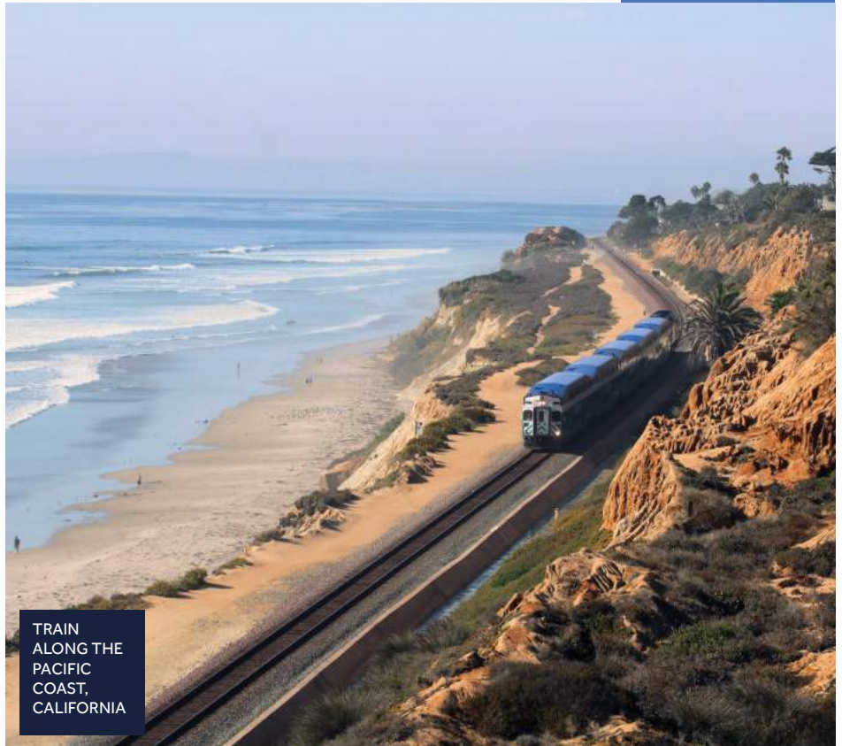
TRAIN ALONG THE PACIFIC COAST, CALIFORNIA