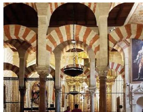
TOP RATED HIGHLIGHT Explore the incredible Mezquita with your Local Expert. (Day 7, Cordoba)