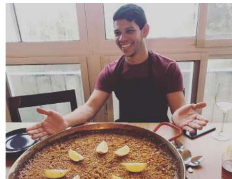
AUTHENTIC DINING Learn the traditional recipe of paella. (Photo by @Simoninsighttd, Day 3, Valencia)

After breakfast, transfers arrive at Madrid airport at 07:00, 09:00 and 11:00. (B)