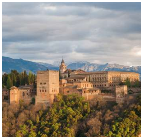
ALHAMBRA PALACE, GRANADA