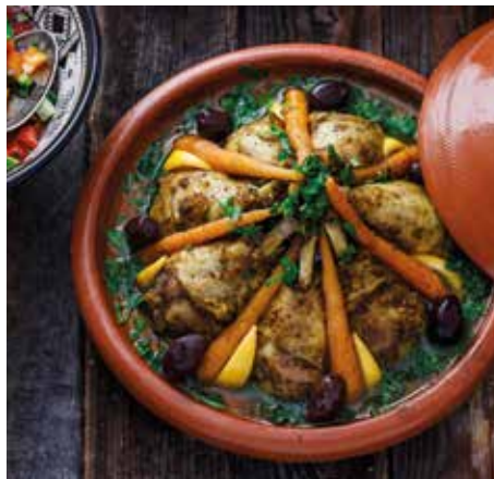
TRADITIONAL MOROCCAN DINNER, MOROCCO