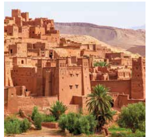
AIT BENHADDOU, MOROCCO