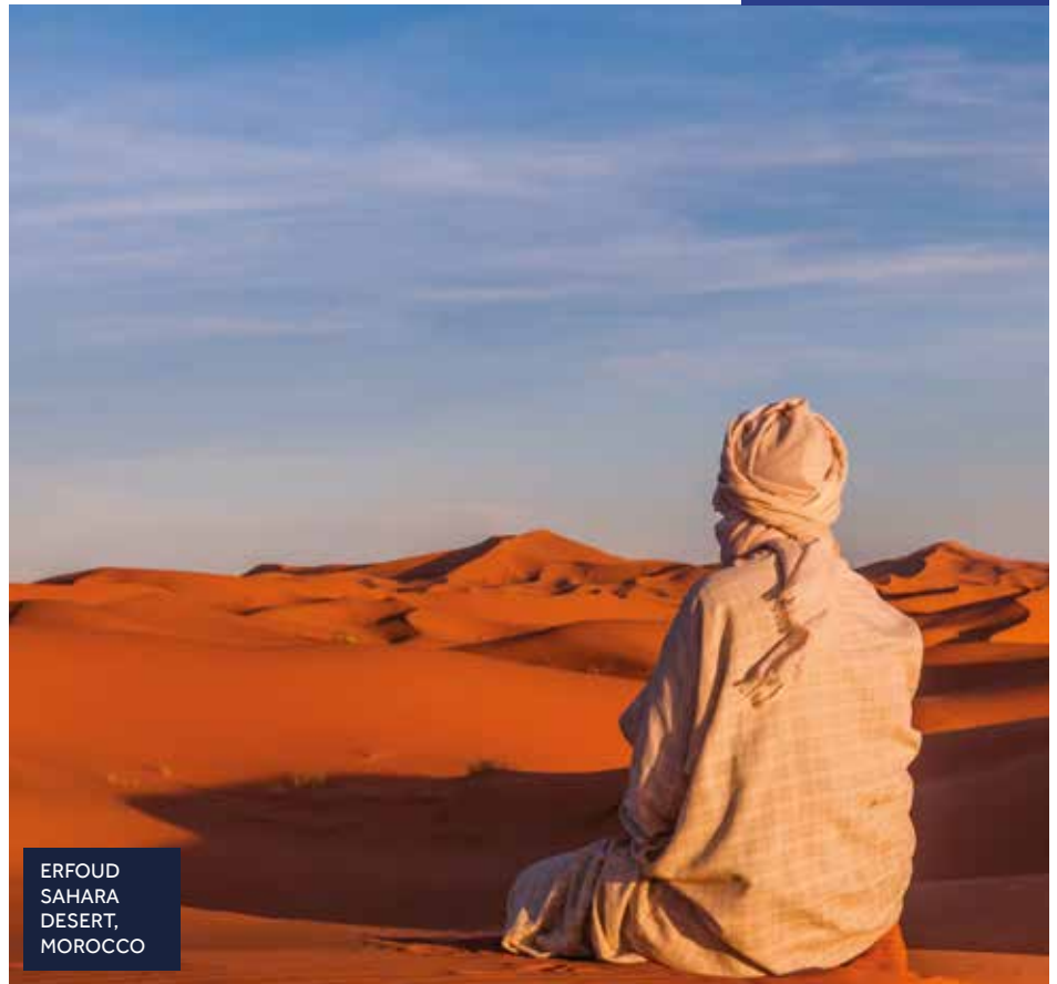
ERFOUD SAHARA DESERT, MOROCCO