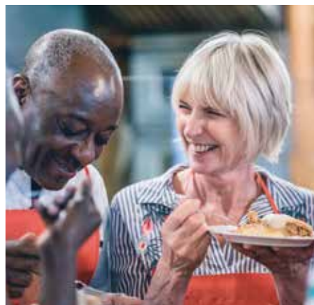
STRUDEL TASTING, BUDAPEST