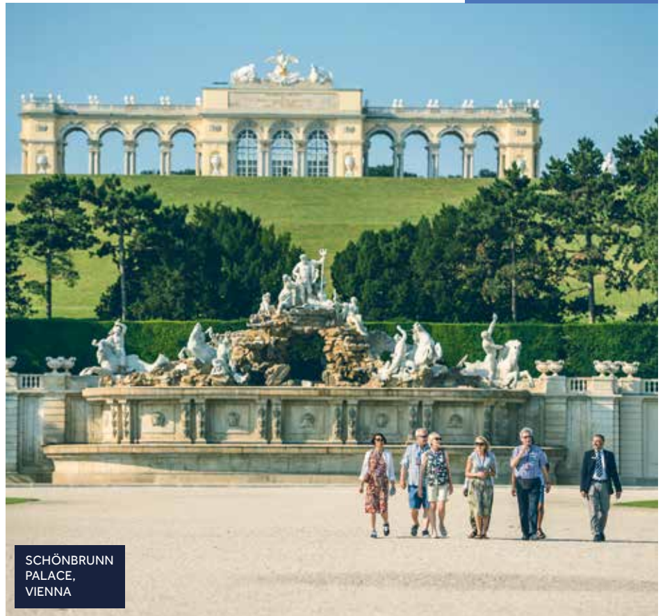
SCHÖNBRUNN PALACE, VIENNA