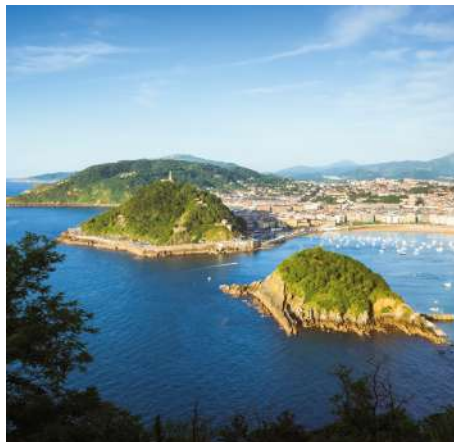
SAN SEBASTIAN, SPAIN