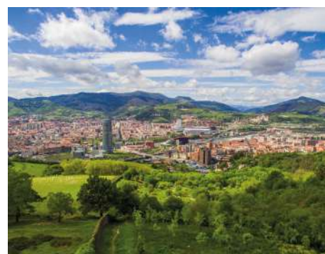
AUTHENTIC DINING Mount Artxanda, Bilbao. (Day 5, San Sebastian)