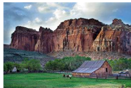
TOP RATED HIGHLIGHT Capitol Reef Park. (Day 8, Capitol Reef National Park)