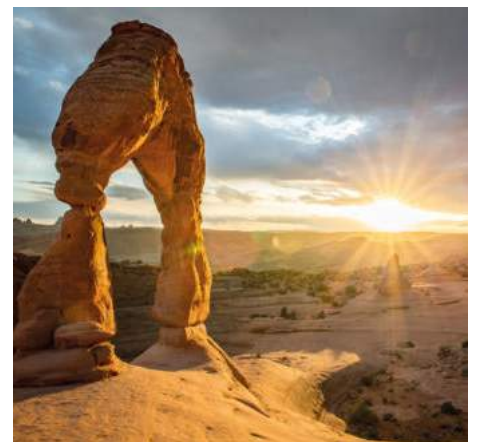
ARCHES NATIONAL PARK