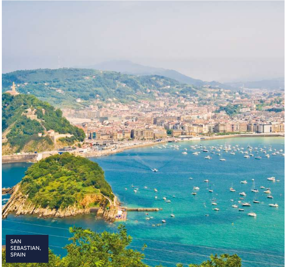
SAN SEBASTIAN, SPAIN