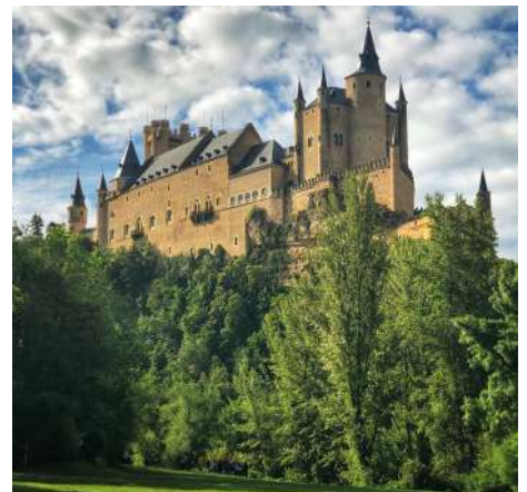
@LEANNE4874, SEGOVIA'S ALCAZAR (OPTIONAL)