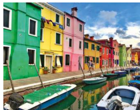
TOP RATED HIGHLIGHT See the picturesque fishing village of Burano (Photo by @skinnylynn, Day 10, Burano)