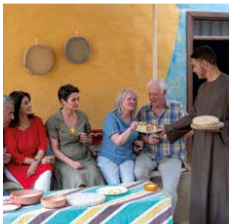
EGYPTIAN SUN BREAD, LUXOR