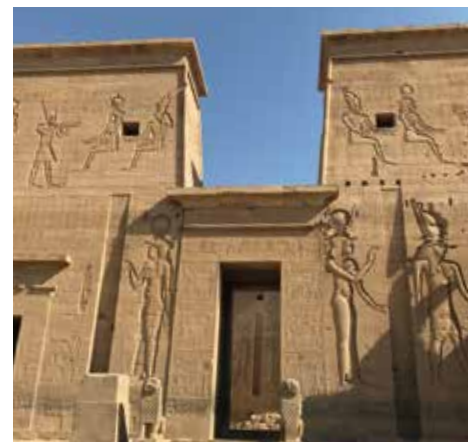
@ULLA, PHILAE TEMPLE