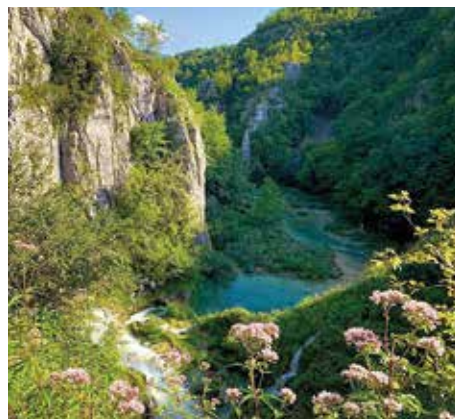
@SHARON_INSTA, PLITVICE LAKES