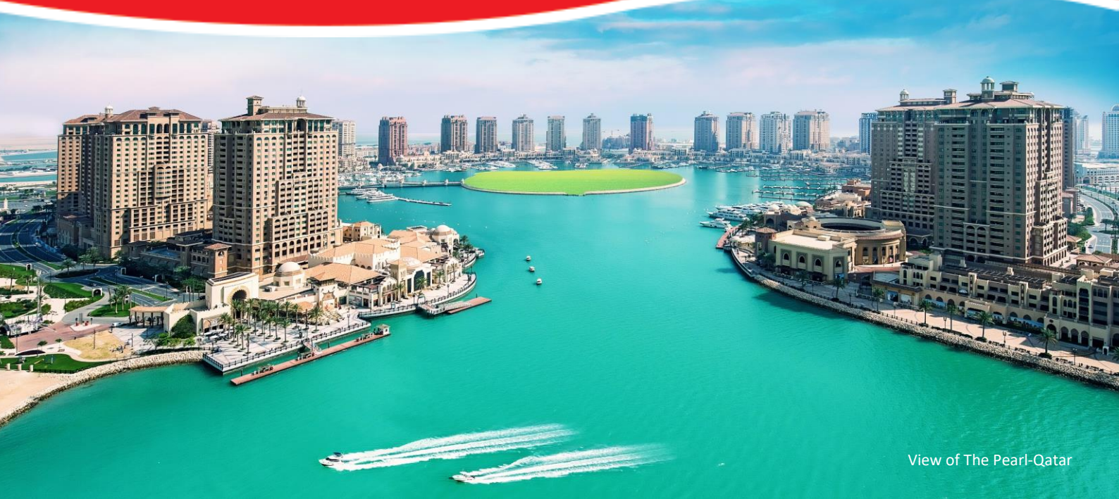
View of The Pearl-Qatar