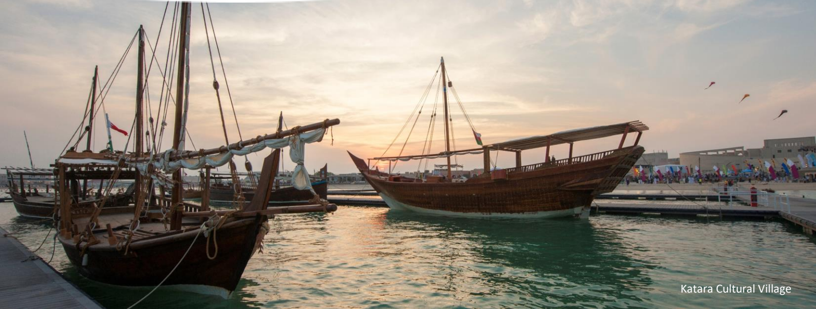
Katara Cultural Village