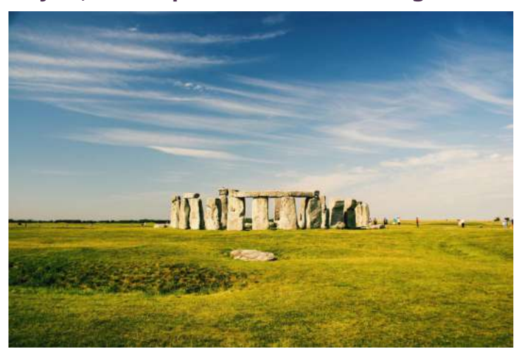
Day 8 | Soak up Bath and Stonehenge then off to London

Traversing the Severn Estuary into England, arrive in the glorious UNESCO listed city of Bath, with its elegant Georgian façades and visit the world-famous Roman Baths for a MAKE TRAVEL MATTER® Experience. Journey across the scenic landscapes of Wiltshire, paying a visit to the mysterious megalithic stone circle at Stonehenge, then return to London where your memorable holiday in Britain and Ireland comes to an end.