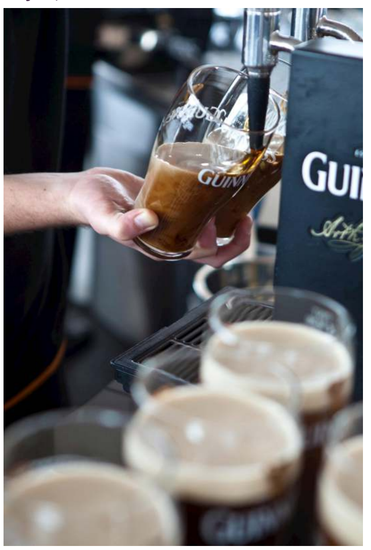
Day 5 | Discover Diverse Dublin

Dive Into Culture and discover the fascinating 250vear-old story of Guinness at its original home, the Guinness Storehouse. Top it off with a taste in their Gravity Bar while you enjoy the panoramic views of Dublin. Drive through the pretty streets of Dublin with a Local Specialist to admire the stately Georgian Squares, Trinity College and St. Patrick's Cathedral, the tallest church in Ireland, before spending the rest of the day exploring the sights alone. Ramble through Temple Bar or Grafton Street, famous for its colourful street performers. This evening, consider joining an Optional Experience to a rousing Irish cabaret performance.